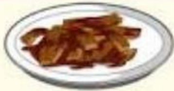
Pickled Bamboo Shoots