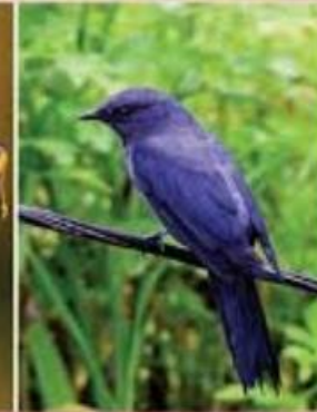
Large Niltava ( Niltava grandis )