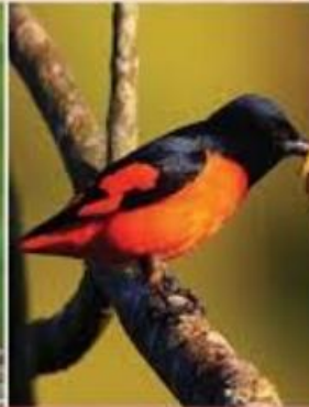
Long-tailed Minivet ( Pericrocotus ethologus )