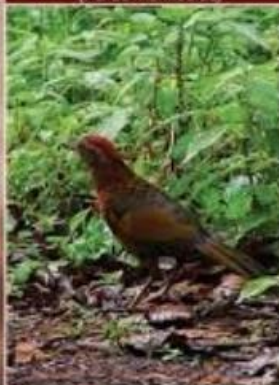
Chestnut-crowned Laughing-thrush ( Trochalopteron erythrocephalum )