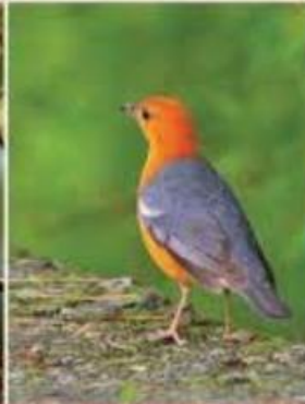
Orange-headed Thrush ( Geokichla citrina )