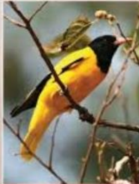
Black-hooded Oriole ( Oriolus xanthornus )