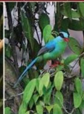
Common Green Magpie ( Cissa chinensis )