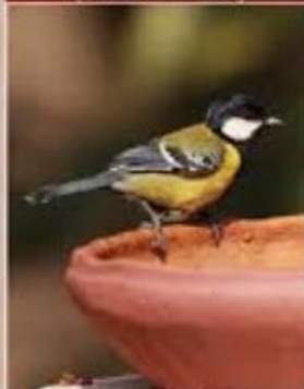
Green-backed Tit ( Parus monbocotus )