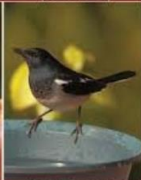
Oriental Magpie Robin ( Copsychus saularis )