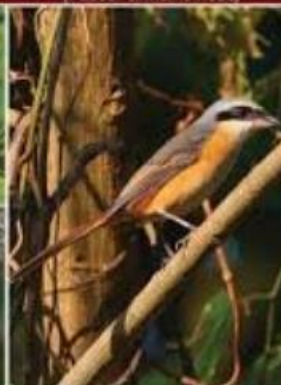
Grey-backed Shrike ( Lanius lephronotus )