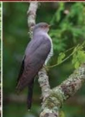
Oriental Cuckoo ( Cuculus saturatus )