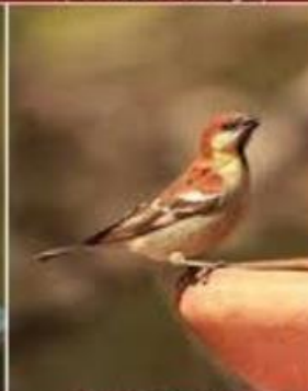
Russet Sparrow ( Passer cinnamomeus )