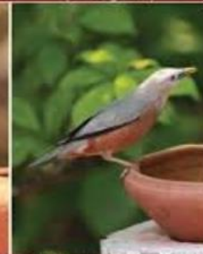
Chestnut-tailed Starling ( Sturnia malabarica )